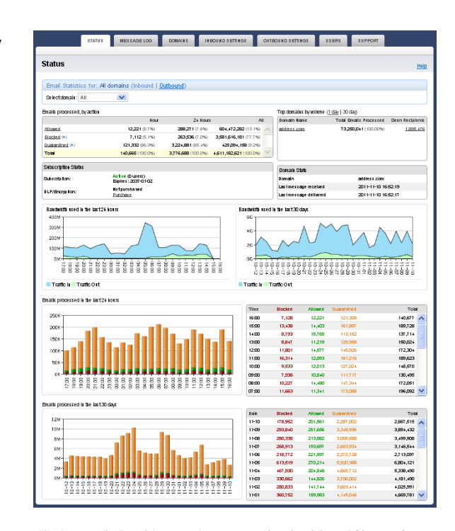
The Barracuda Email Security Service provides cloud-based filtering for inbound and outbound email and displays the number of messages with statistics on how they were processed.

The Barracuda Email Security Service can start filtering inbound and outbound email in a matter of minutes without any additional software or hardware. Users can access their own message log to deliver quarantined emails or whitelist senders to ease the burden of administration.